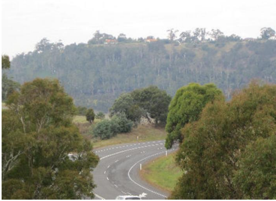
Looking South to Grindelwald 20110410_56a.jpg (38.92 KiB)