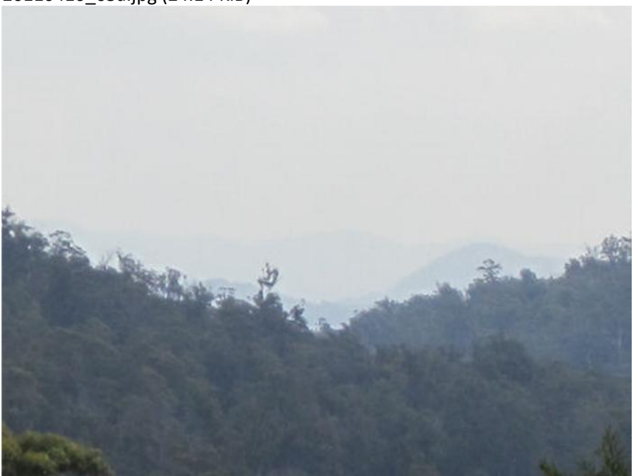
Looking West, the hills and trees are painted out by smoke 20110410_57a.jpg (17.81 KiB)