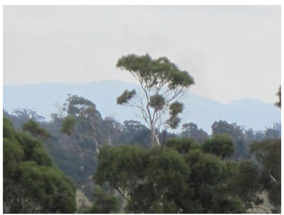
Looking West the smoke was terrible 20110410_58a.jpg (26.62 KiB)