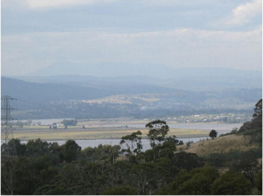
Mount Barrow and all around was covered 20110410_61a.jpg (28.73 KiB)