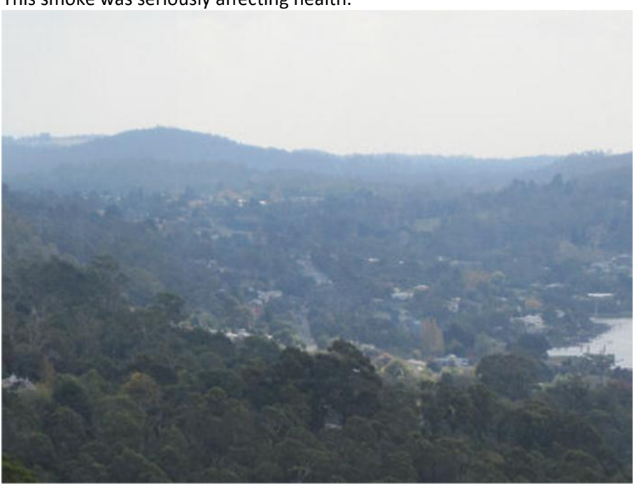
Looking N/W over Exeter 20110410_55a.jpg (24.26 KiB)

This smoke was seriously affecting health.