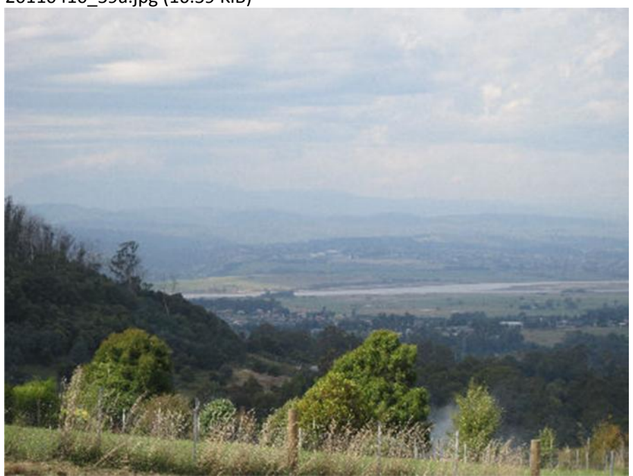
Mt Barrow was not visible from Grindelwald or Trevallyn 20110410_62a.jpg (36.56 KiB)

All the way out to Mt Arthur in the East was covered. 20110410_59a.jpg (16.59 KiB)