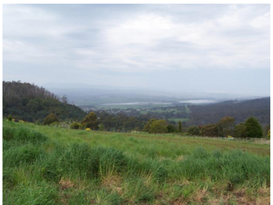
Taken from Grindelwald looking E over the Tamar River and towards Launceston. No mountains visible. 100_3047-2b.jpg (206.83 KiB)