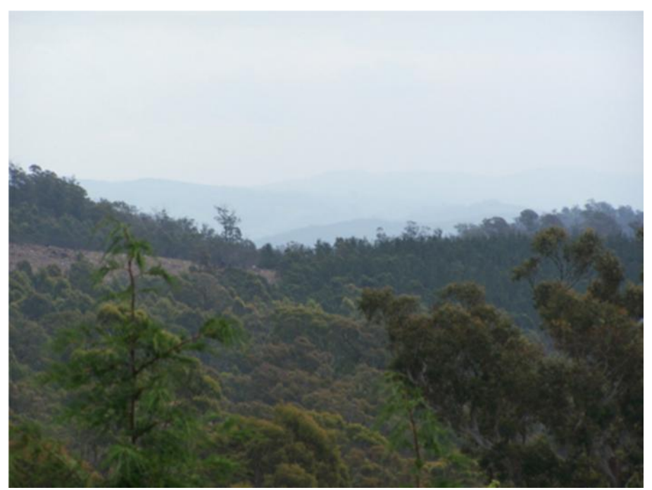
Again from Grindelwald looking N. Note the smoke has come right up into the nearest trees, other smoked out. 100_3055-4b.jpg (186 KiB)