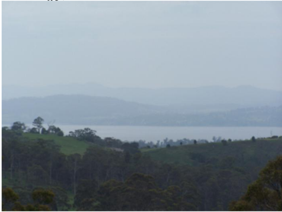
From Brady's Lookout to the N. Visibility was from a few hundred meters to about 1 to 2Km 100_3056-5b.jpg (156.93 KiB)