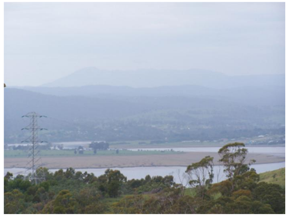
Towards Mt. Barrow 100_3065-10b.jpg (176.21 KiB