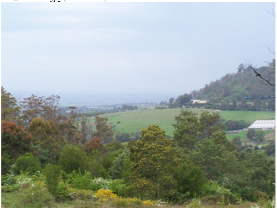
Launceston was not visible from the West Tamar highway 100_3070-13b.jpg (214.35 KiB)