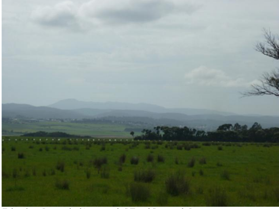
Taken from Legana looking towards S/E and S. towards Launceston Picture 007-1b.jpg (152.07 KiB)

Next I contacted the Environmental Health Department. They weren't aware the Smoke Strategy was not operating. They believed my complaint should be able to be processed. Owing to the wide spread concentration of environmental smoke in the north of Tasmania that was directly affecting my health I left it with this department to come back to me. Below are some of the photos I took between 1130am and 4pm. Some are looking south towards Launceston....I say towards because Launceston is not visible! Others are in every other direction showing the extent of this deliberate pollution.