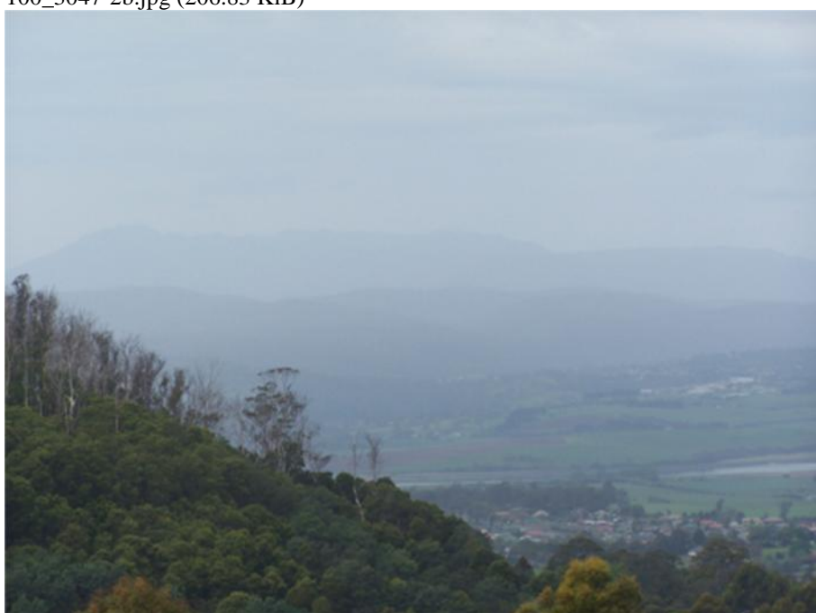
Taken from Grindelwald looking over the Tamar River towards Mt. Barrow, barely visible. 100_3048-3b.jpg (171.11 KiB)