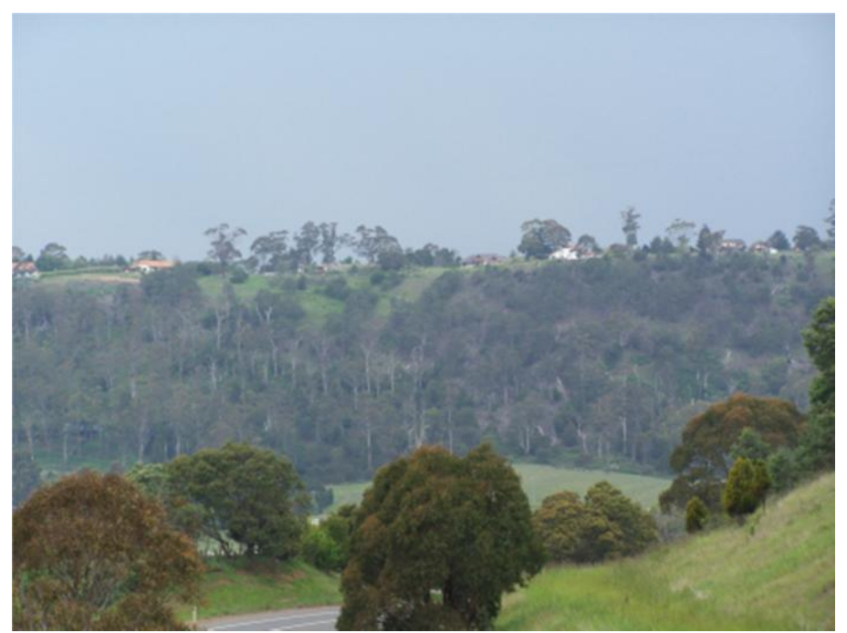
Grindelwald again. The smoke makes it look like a cheap camera was used with a plastic lens! Auto focus would not lock on because of the smoke, manual methods had to be used. 100_3069-12b.jpg (206.22 KiB)