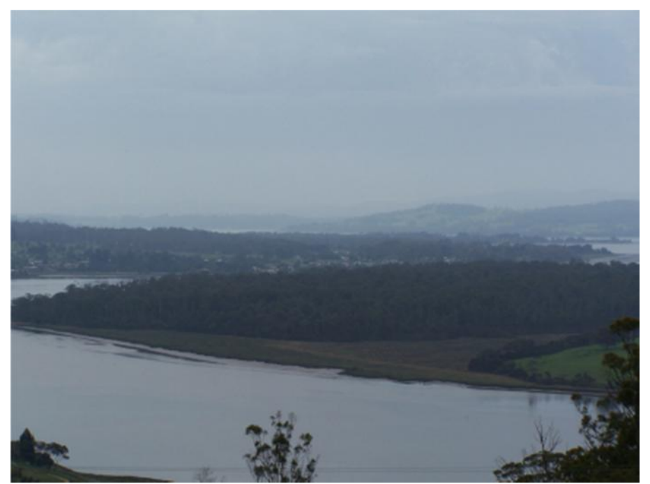
Looking over the beautiful? Tamar River. Everything was greyed out by the blue smoke 100_3058-6b.jpg (164.34 KiB)