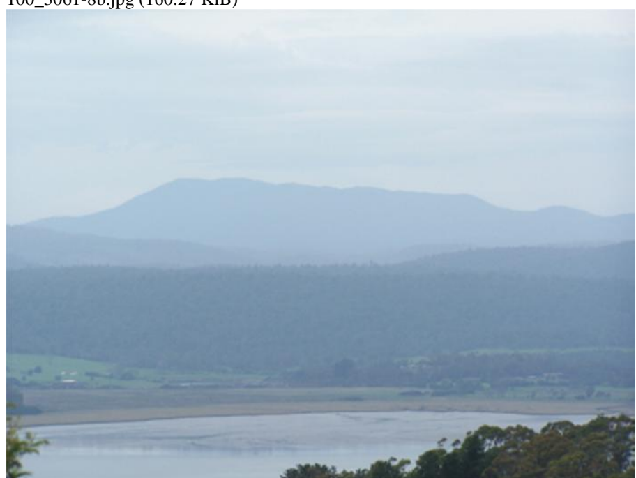
From Brady's Lookout to Mt. Arthur or what you can see of it. 100_3064-9b.jpg (154.37 KiB)