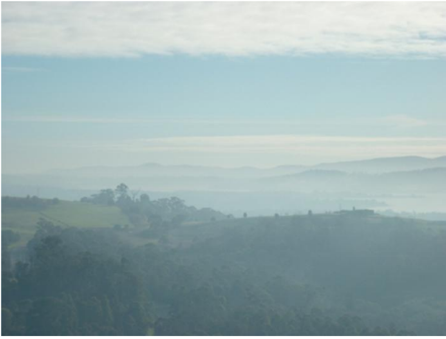
Selfish burners. Disgusting and unnecessary smoke. P1010437a.jpg (131.21 KiB)