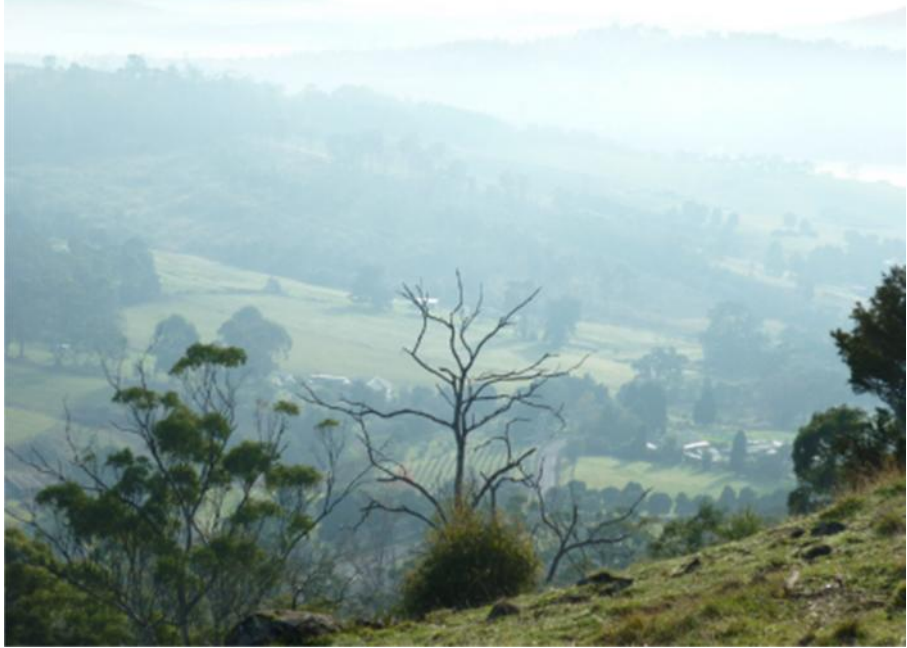
Taken from Grindelwald looking E.N/E That's where the burns were by the way. P1010436a.jpg (194.29 KiB)