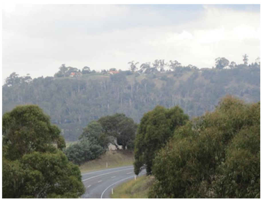
From Brady's Lookout smoke can be seen the short distance to Grindelwald 20120518_13a.jpg (151.5 KiB)