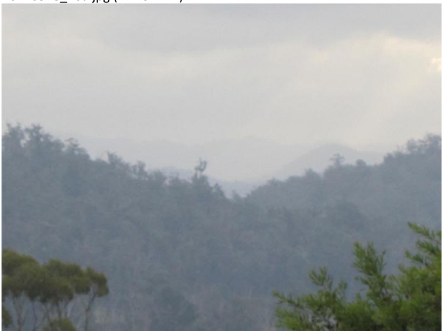
Smoke could be seen out to the west 20120518_12a.jpg (106.17 KiB)

Smoke from a Parks? low intensity burn was blowing SSE right into Exeter and up the hill to Grindelwald. It had spread out in width by now as the wind changed direction. 20120518_16a.jpg (124.97 KiB)