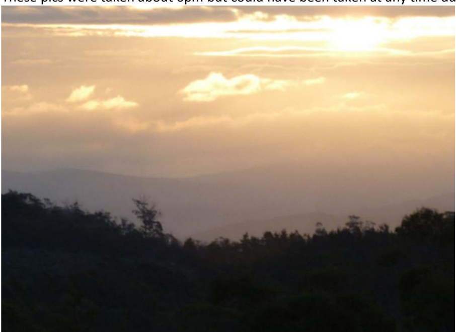
Unbelievable smoke to the N/W P1010252a.jpg (161.47 KiB)

These pics were taken about 6pm but could have been taken at any time during the day.