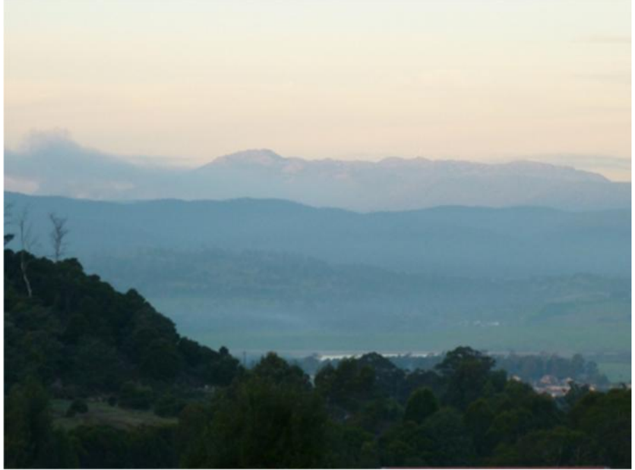
The Tamar valley was smoked out. I had difficulity focussing the camera because of the smoke. The localized burn near Mt. Barrow to the East added to the wide scale pollution. P1010248a.jpg (135.15 KiB)