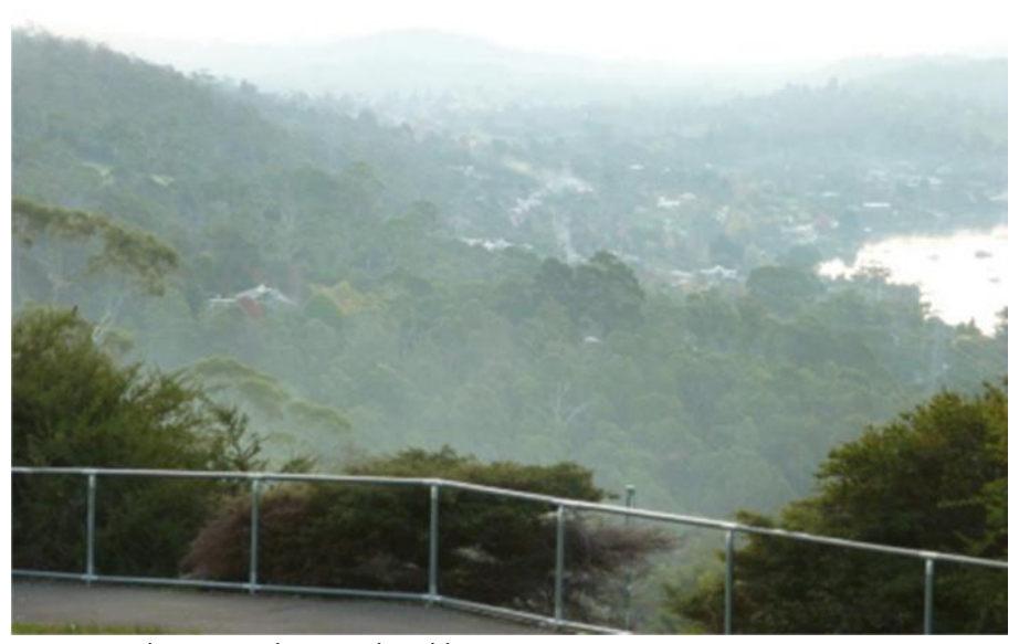
Exeter and surrounds were hard hit. P1010245a.jpg (146.89 KiB)