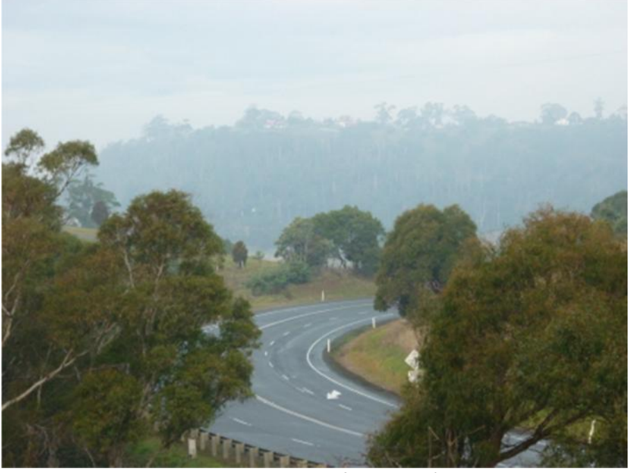
This shot is looking towards Grindelwald from Brady's Lookout. Visibility was down to 1 or 2 Km. It shows how dangerous this was for people to be breathing. P1010416a.jpg (176.92 KiB)