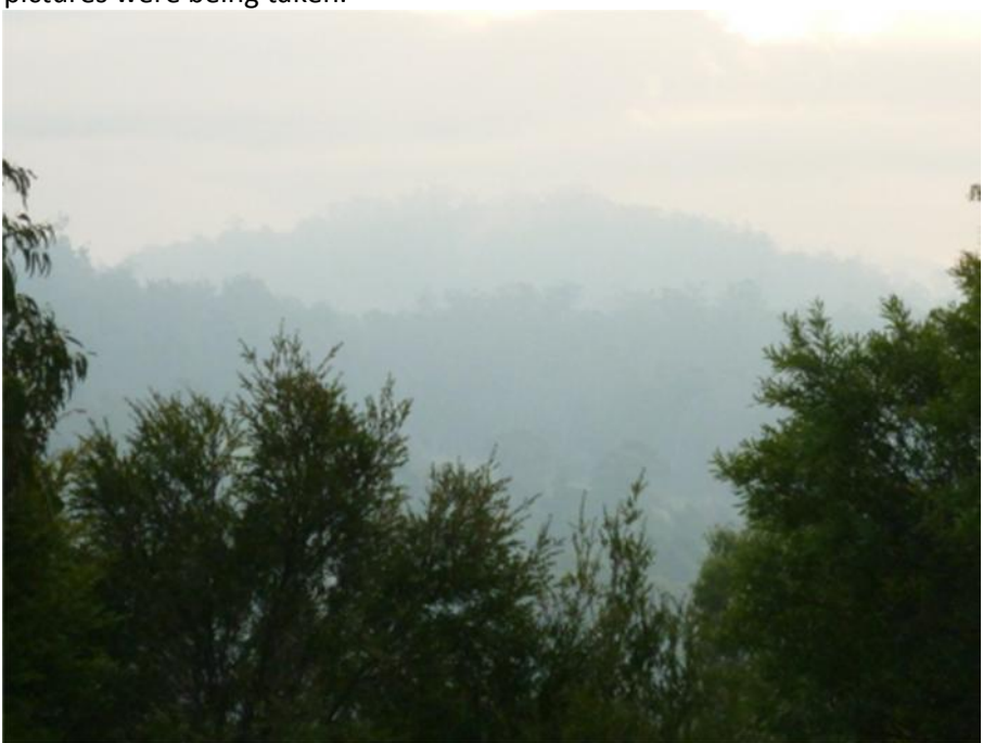
Looking out to the West P1010424a.jpg (169.13 KiB)

Blue smoke was flowing up through the valleys into Grindelwald long before, and while these pictures were being taken.