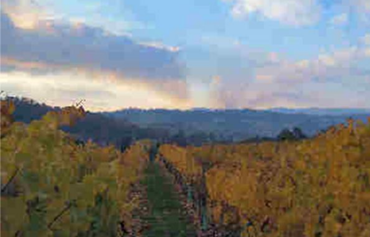
Smoke drifts towards us. Photo taken in vineyard behind our property. 100_1772.1a.jpg (12.38 KiB)