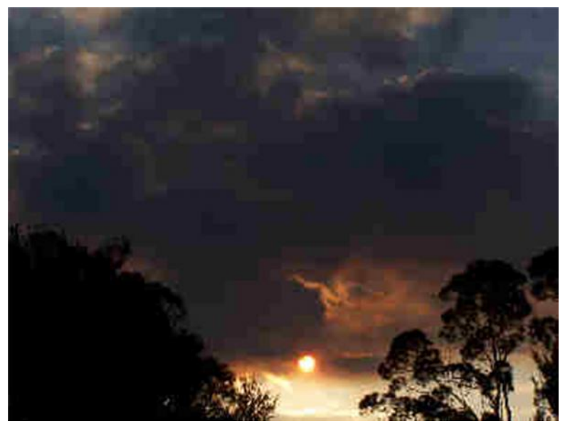
We are in the smoke. Photo taken at our side fence.