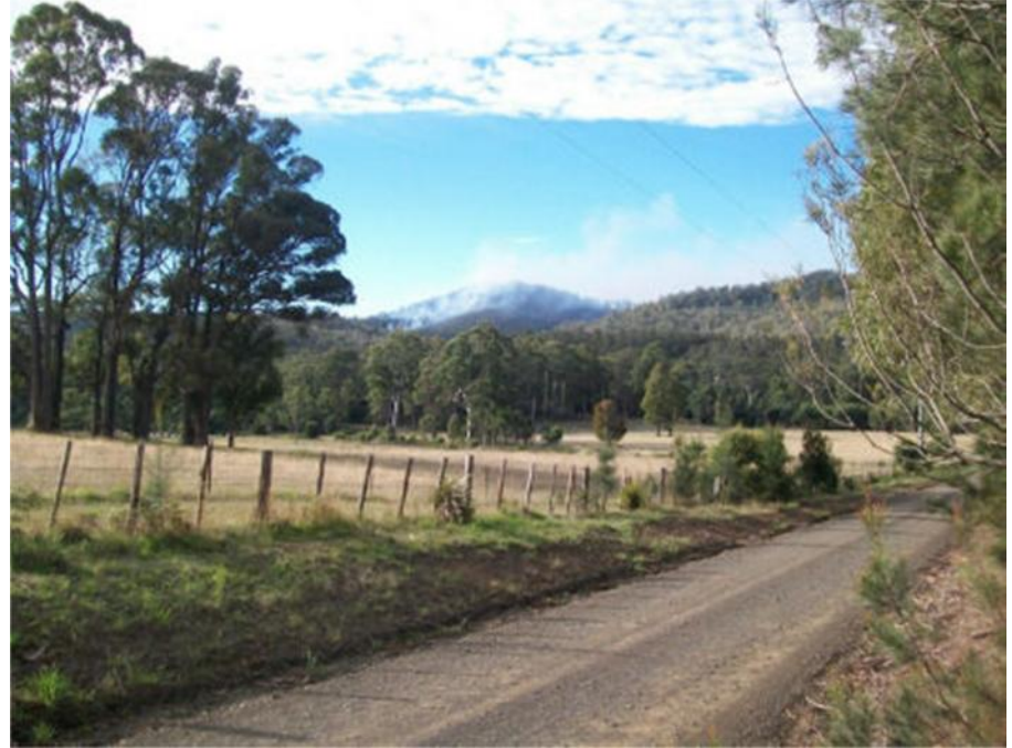
Mt. Dismal2a.jpg (45.57 KiB)