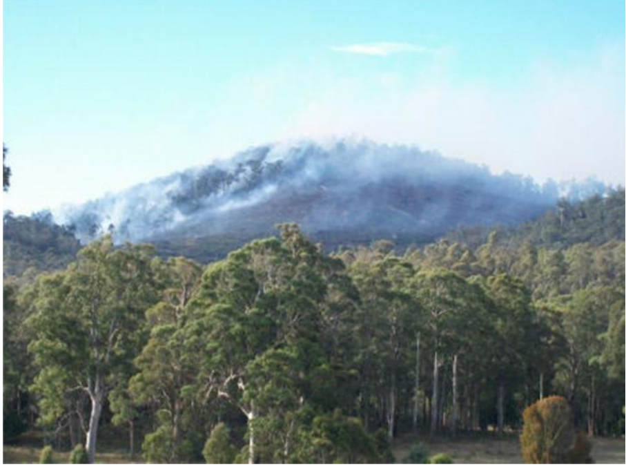
Mount Dismal - PICTURES by JODIE SADDINGTON MtDismal1a.jpg (31.76 KiB)

This may be a Gunns burn. It too was lit about noon.