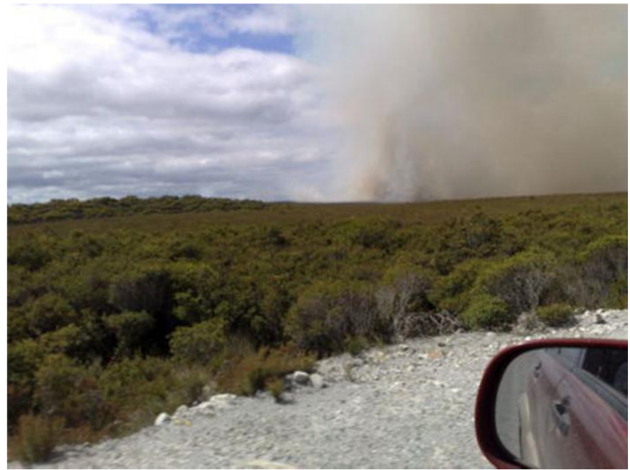
103a.jpg (37.3 KiB) Viewed 1019 times