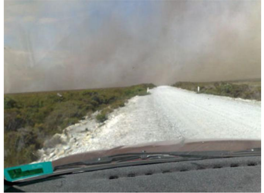
102a.jpg (29.6 KiB) Viewed 1023 times