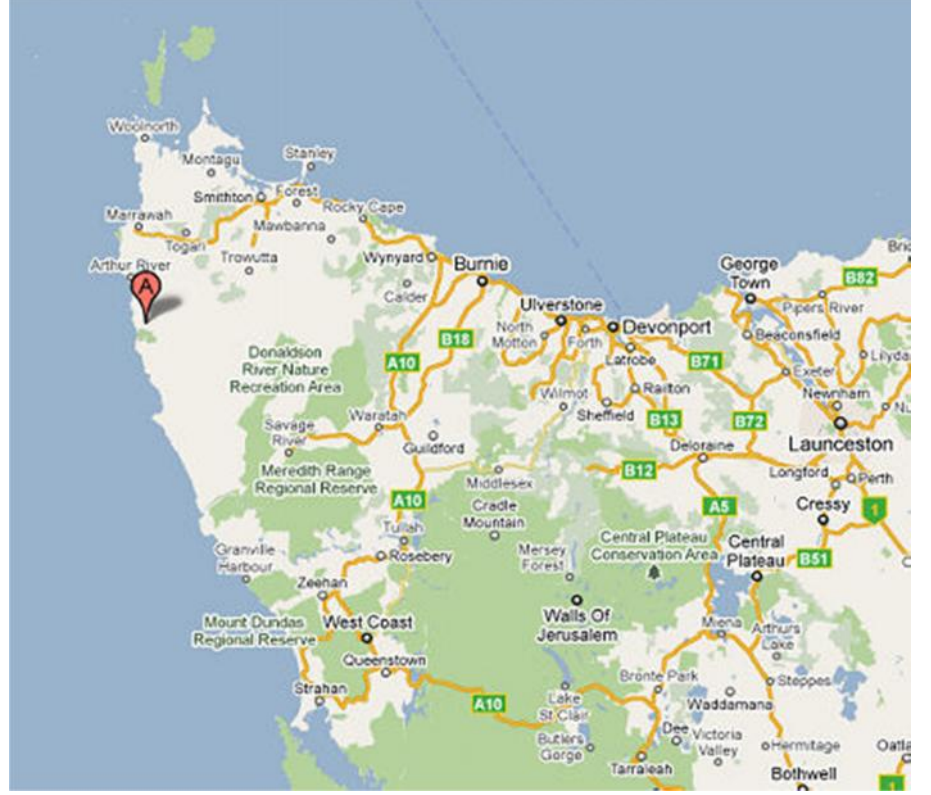
Googlemap.jpg (49.32 KiB) Viewed 1029 times

And at the same time the glow could be seen, wind, heading in my direction, rocked my tent, keeping us awake, wondering and contemplating my escape to safety.....if...."