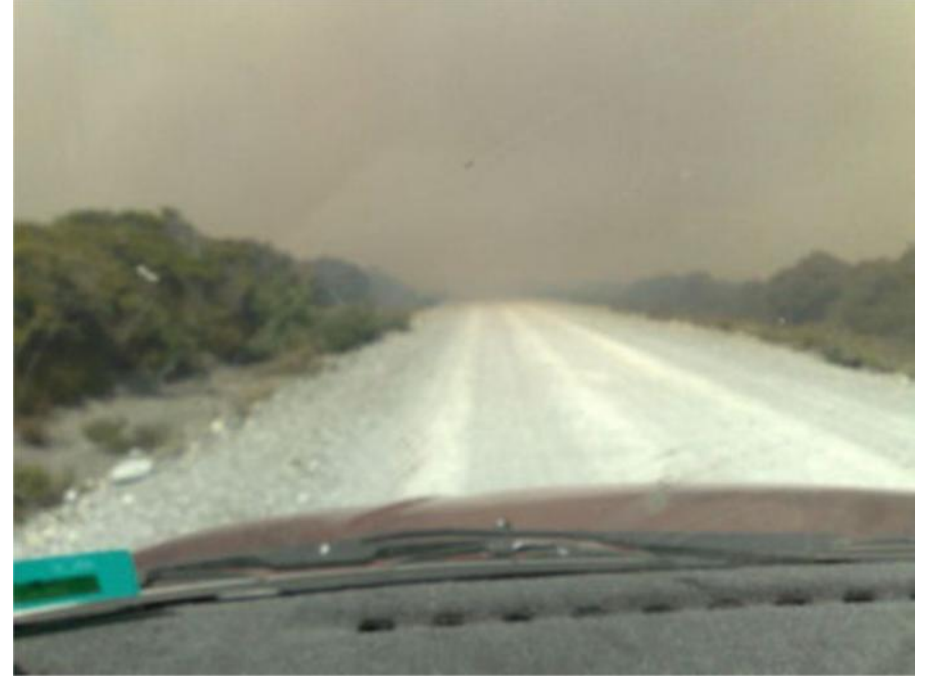
104a.jpg (23.36 KiB) Viewed 1020 times