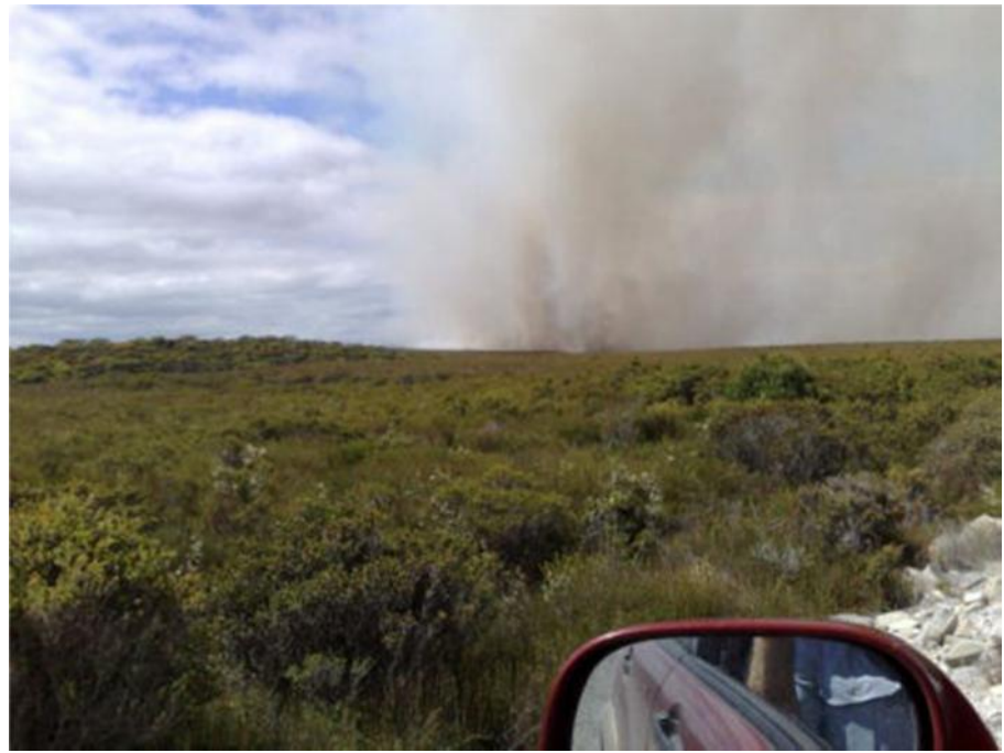
101a.jpg (37.61 KiB) Viewed 1022 times