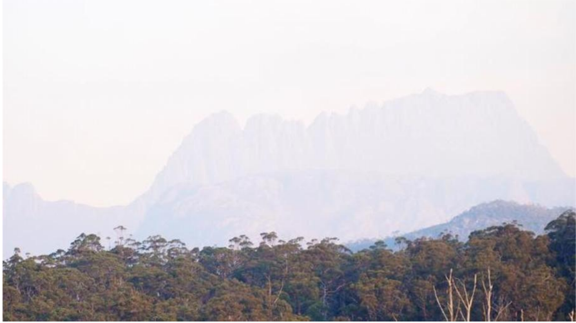
Environmentalist Bob Brown says Forestry Tasmania's regeneration burns have left iconic Cradle Mountain and Dove Lake swathed in smoke.