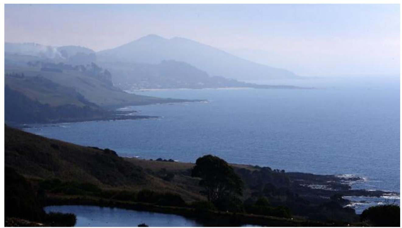
Regeneration Burn North-West Tasmania, Sisters Hills from Table Cape.

Calls to the EPA for comment by the Mercury were not returned yesterday.