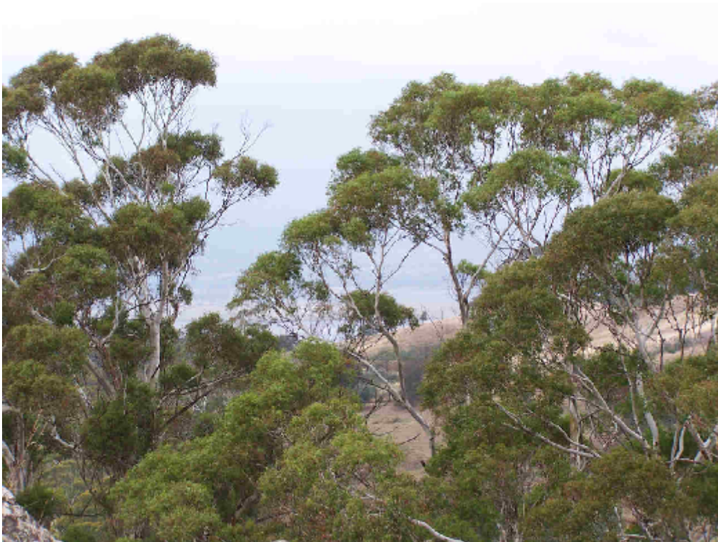
2465 The landscape is not visible