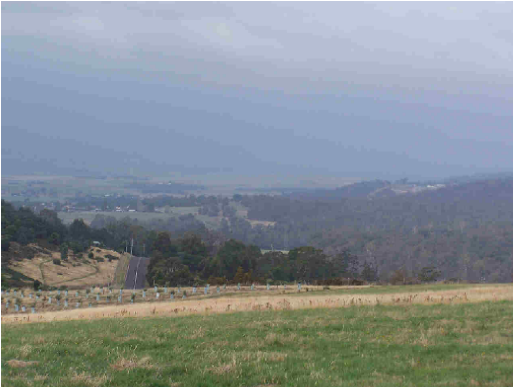
2474 Launceston - the disappearing city