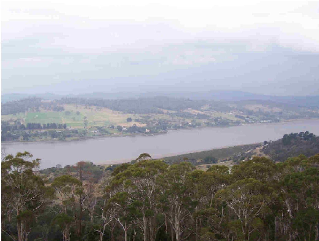
2462 The extent of the smoke can be seen. The whole valley is covered.