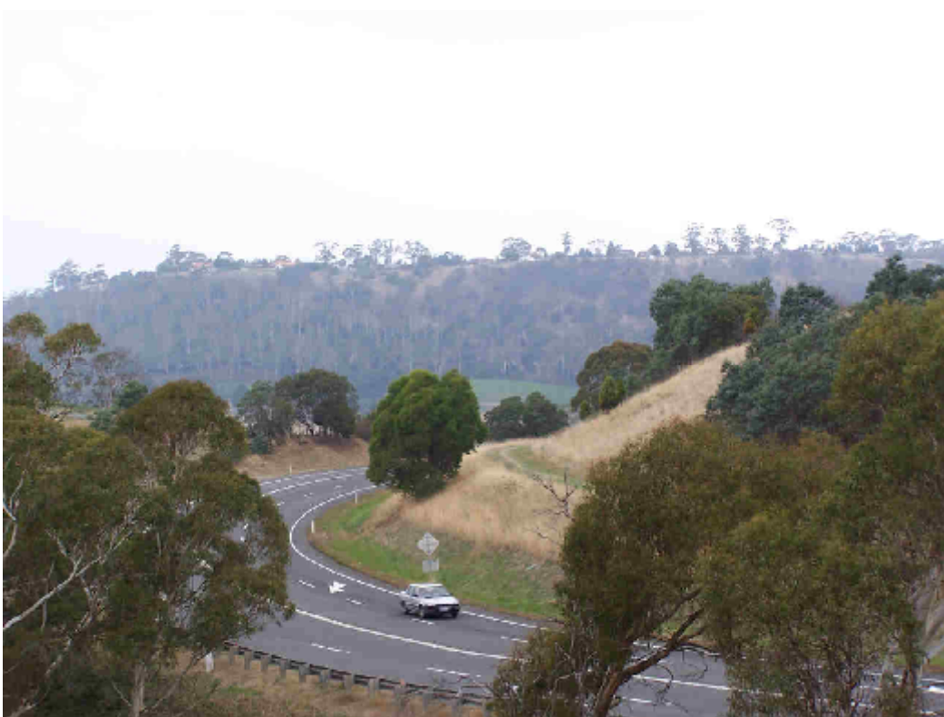
2466 Only 2Km to Grindelwald on the hill. Health is put at risk again