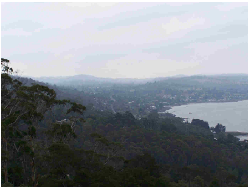
2460 Smoke as far as you can see; extending right up into the trees in the foreground.