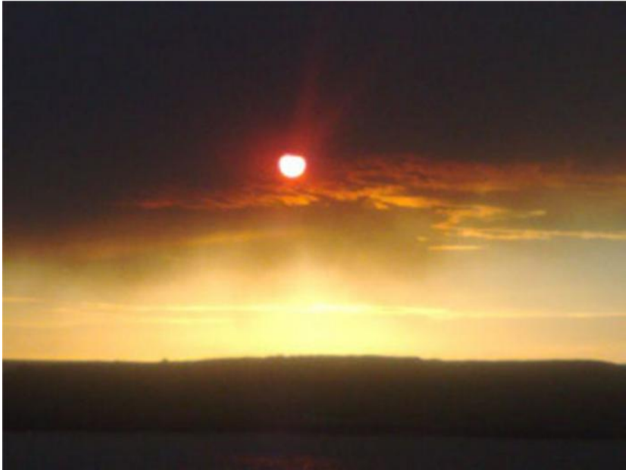
Deadly sky 110a.jpg (21.79 KiB) Viewed 1034 times