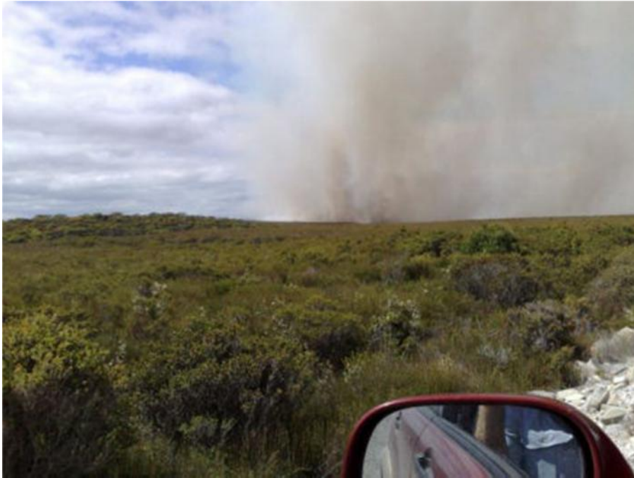
101a.jpg (37.61 KiB) Viewed 1022 times