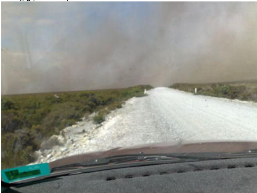
102a.jpg (29.6 KiB) Viewed 1023 times