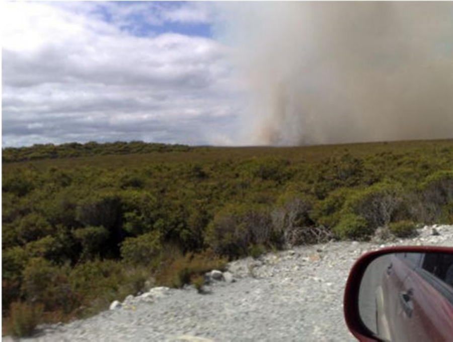
103a.jpg (37.3 KiB) Viewed 1019 times