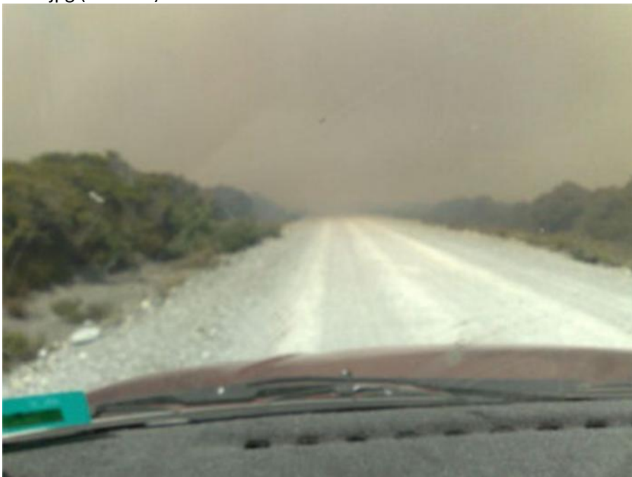
104a.jpg (23.36 KiB) Viewed 1020 times