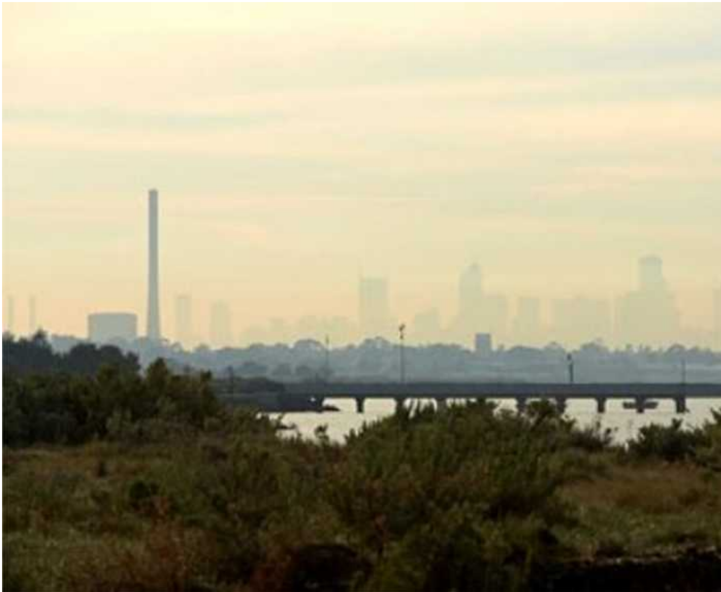
Melbourne smog.

However, smoke from household wood heaters, motor vehicles and other urban sources have worsened conditions.