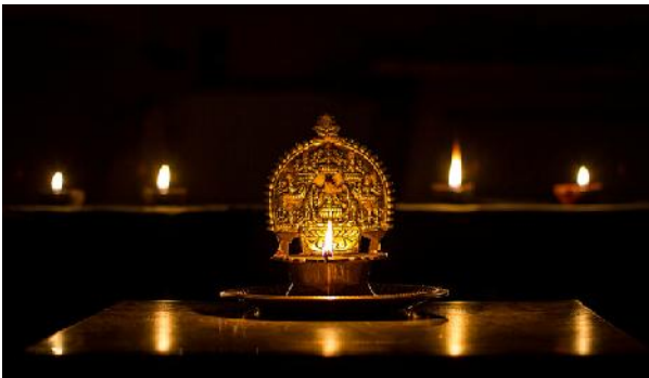
A more traditional Diwali light display.

Researchers in London have collected airborne particles from Diwali and Guy Fawkes. These were found to deplete lung defences far more than pollution from traffic sources, suggesting a greater toxicity. Across India, Diwali fireworks have been linked to a 30% to 40% increase in recorded breathing problems. Like New Year's Eve, fireworks are a relatively new phenomenon at Diwali.