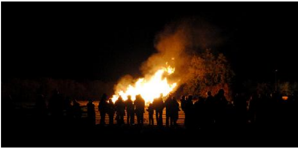
Bonfire night.

Guy Fawkes is regularly the most polluted day of the year in the UK, although scientists from King's College London have found that pollution from bonfires – the traditional way of marking Guy Fawkes – is also a part of this mixture. Fireworks can have significant effects on air pollution in enclosed spaces, too. In Germany, tests have shown how goal and match celebrations with flares, smoke bombs and other pyrotechnics can fill football stadiums with high concentrations of airborne particles.