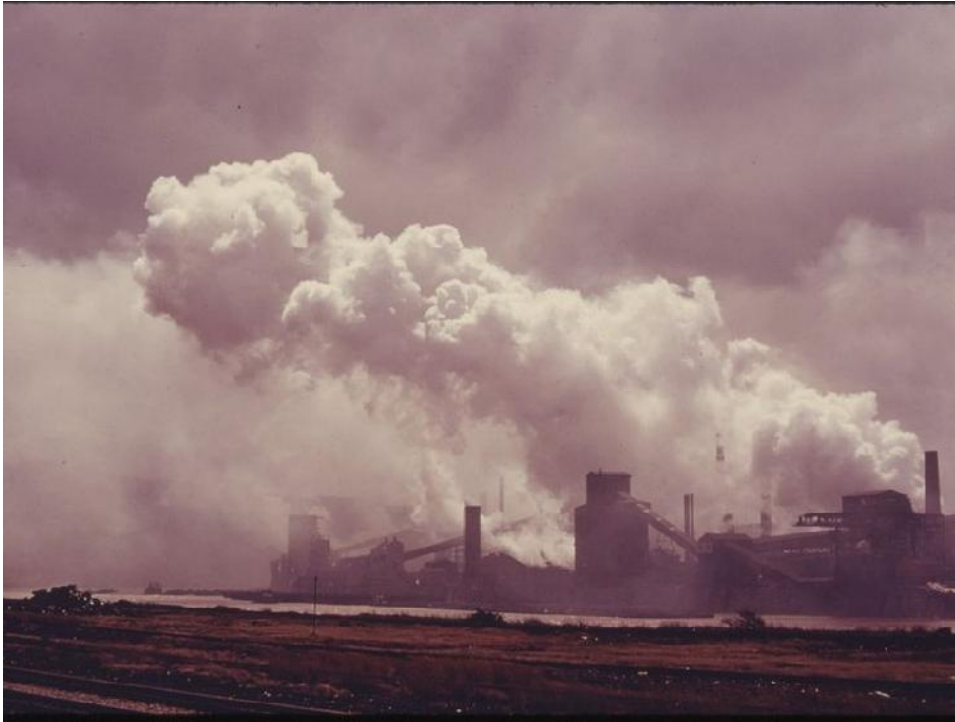
Pollutants hang in the air at a coke plant in Pennsylvania. This plant was photographed in 1973, but humans have been polluting their air for many years before that.

Thousands of years ago, humans were adding lead fumes and other pollutants to the air