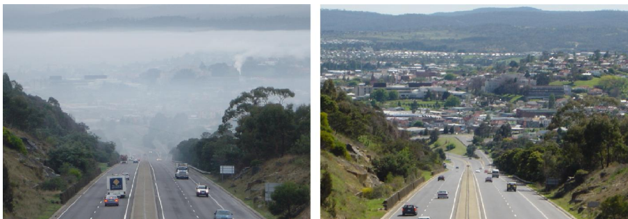
Fig 2 Launceston, Tasmania, showing reduced visibility associated with smoke from domestic wood heaters (left) and same view on clear day (right)