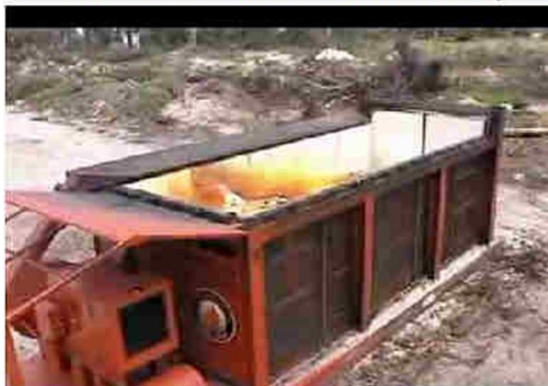
Inside the air burner.