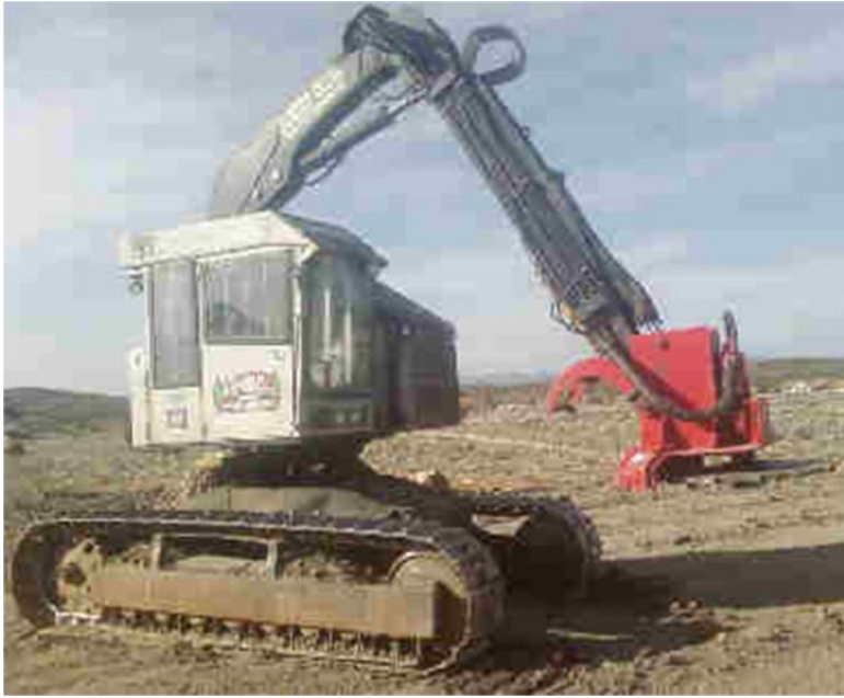
masticator2.jpg (9.67 KiB)