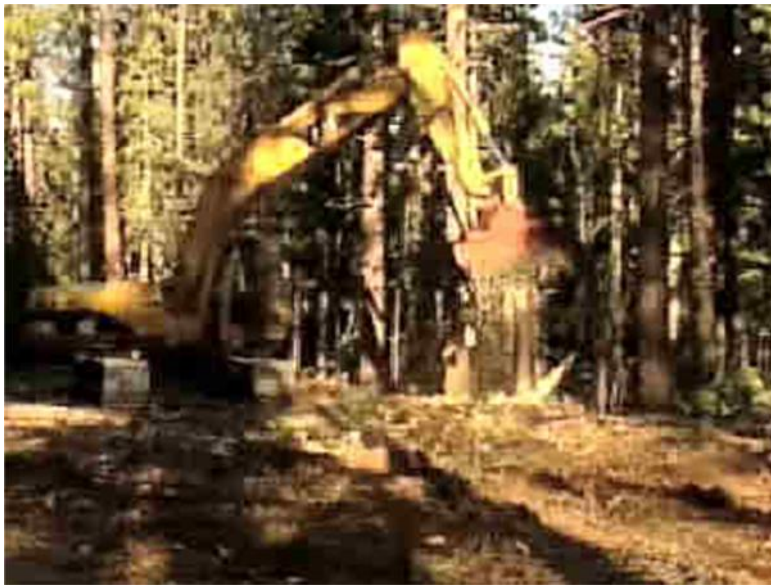
masticator1.jpg (12.32 KiB)

Mastication initially appears to be costly but in the long term it's the least expensive method.