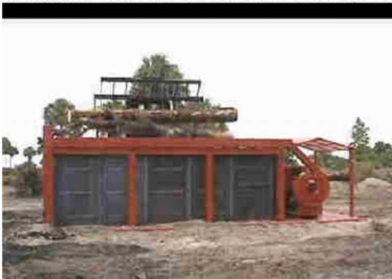
Logs being loaded