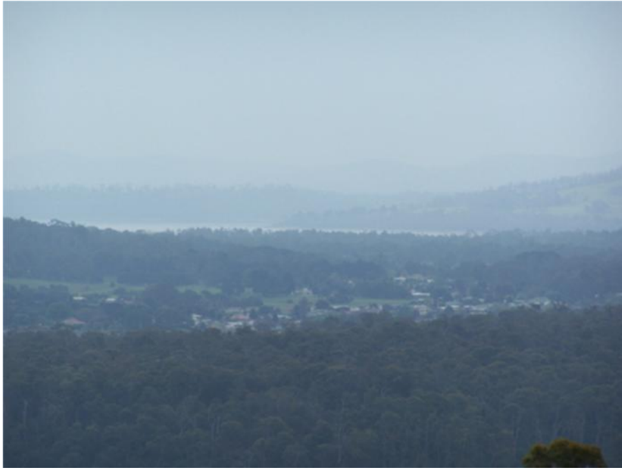
Another Northerly view. It is all smoke. Using the 'visible smoke index' air quality would be deemed unhealthy or hazardous.