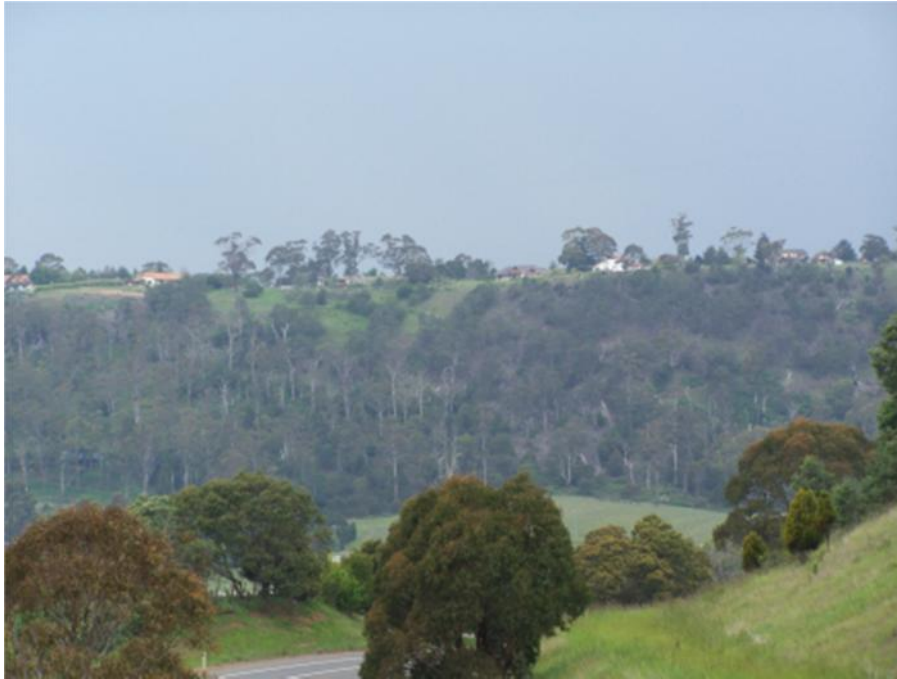
Grindelwald again. The smoke makes it look like a cheap camera was used with a plastic lens! Auto focus would not lock on because of the smoke, manual methods had to be used. 100_3069-12b.jpg (206.22 KiB)