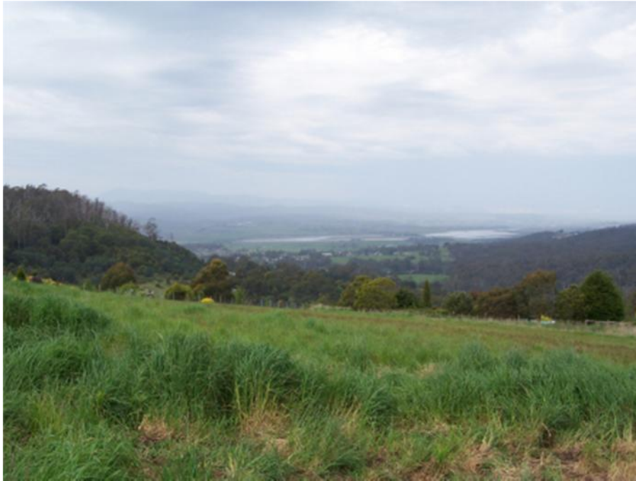
Taken from Grindelwald looking E over the Tamar River and towards Launceston. No mountains visible.