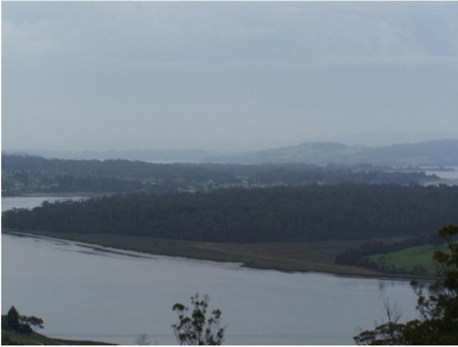
Looking over the beautiful? Tamar River. Everything was greyed out by the blue smoke 100_3058-6b.jpg (164.34 KiB)