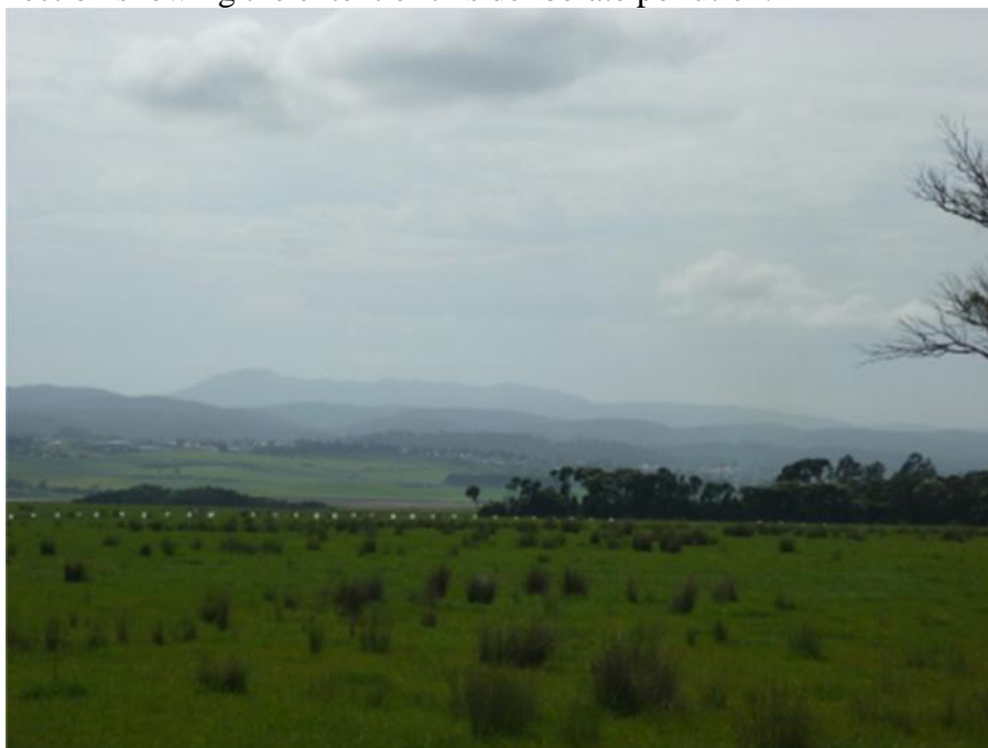
Taken from Legana looking towards S/E and S. towards Launceston Picture 007-1b.jpg (152.07 KiB)

Below are some of the photos I took between 1130am and 4pm. Some are looking south towards Launceston....I say towards because Launceston is not visible! Others are in every other direction showing the extent of this deliberate pollution.