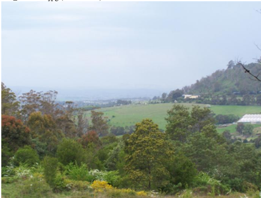
Launceston was not visible from the West Tamar highway 100_3070-13b.jpg (214.35 KiB)