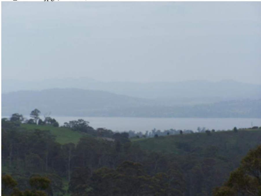
From Brady's Lookout to the N. Visibility was from a few hundred meters to about 1 to 2Km