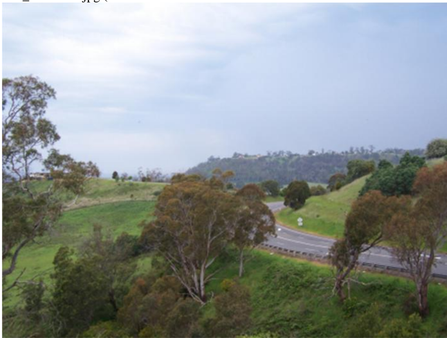
From Brady's Lookout to Grindelwald in the smoke. Nothing is visible towards Launceston 100_3068-11b.jpg (212.27 KiB)