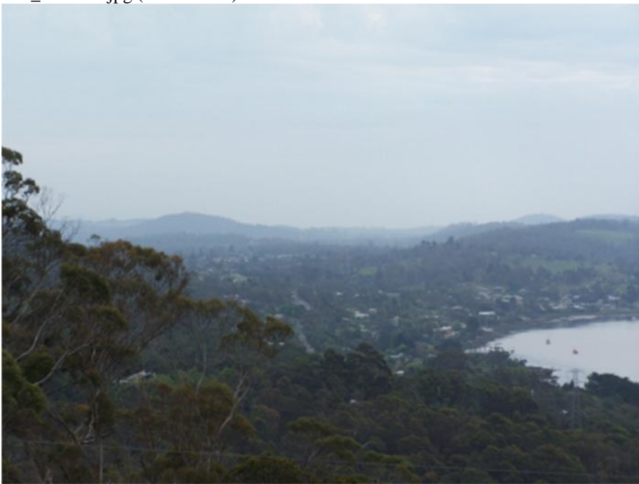
Looking over the town of Exeter. The smoke is always bad in Exeter 100_3059-7b.jpg (178.87 KiB)