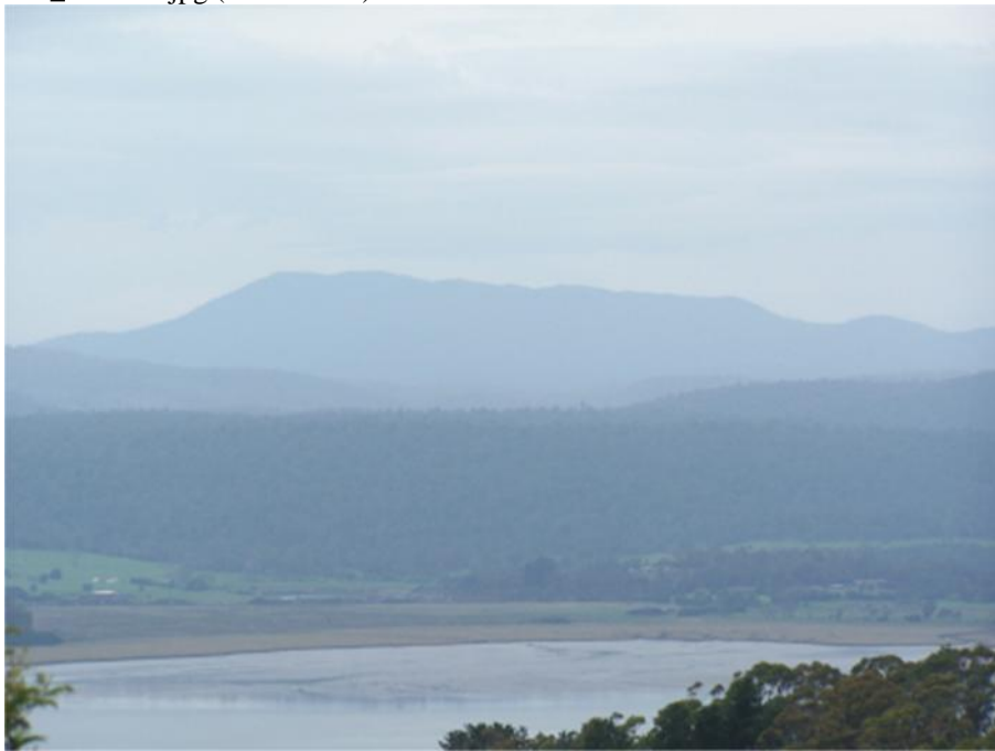
From Brady's Lookout to Mt. Arthur or what you can see of it.