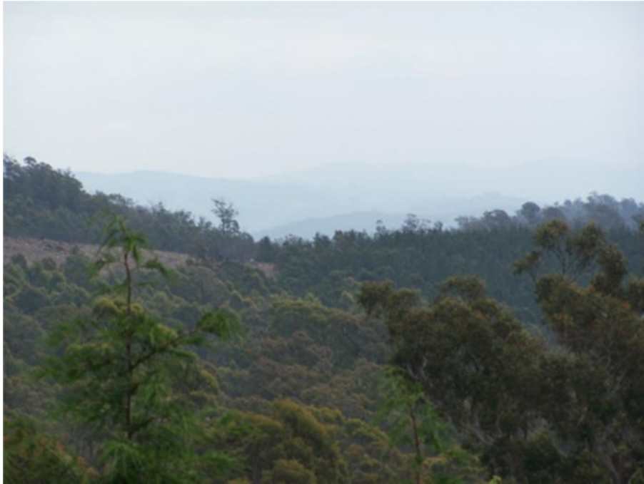
Again from Grindelwald looking N. Note the smoke has come right up into the nearest trees, other smoked out.