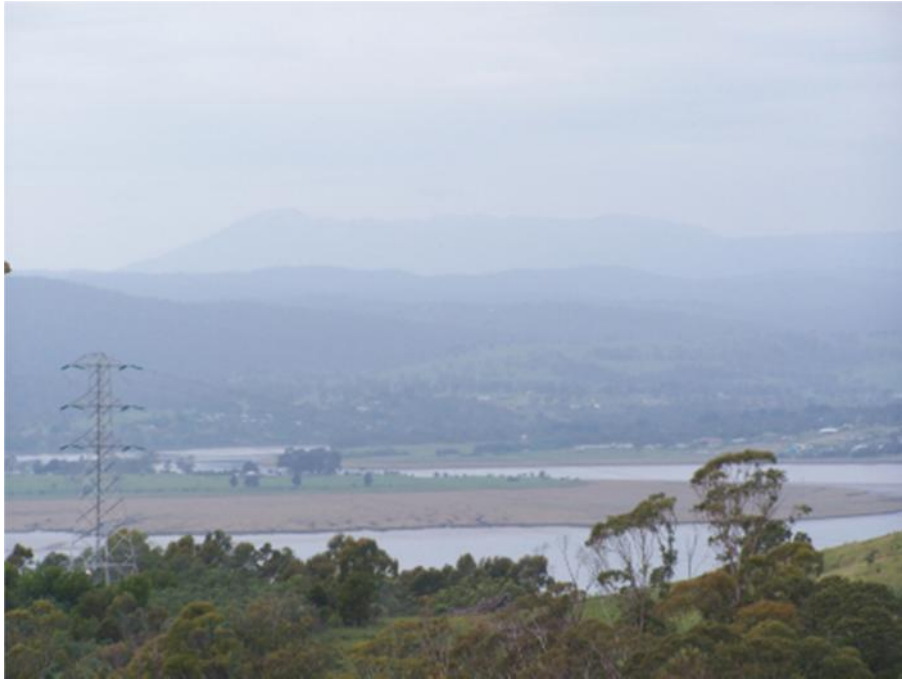
Towards Mt. Barrow 100_3065-10b.jpg (176.21 KiB)