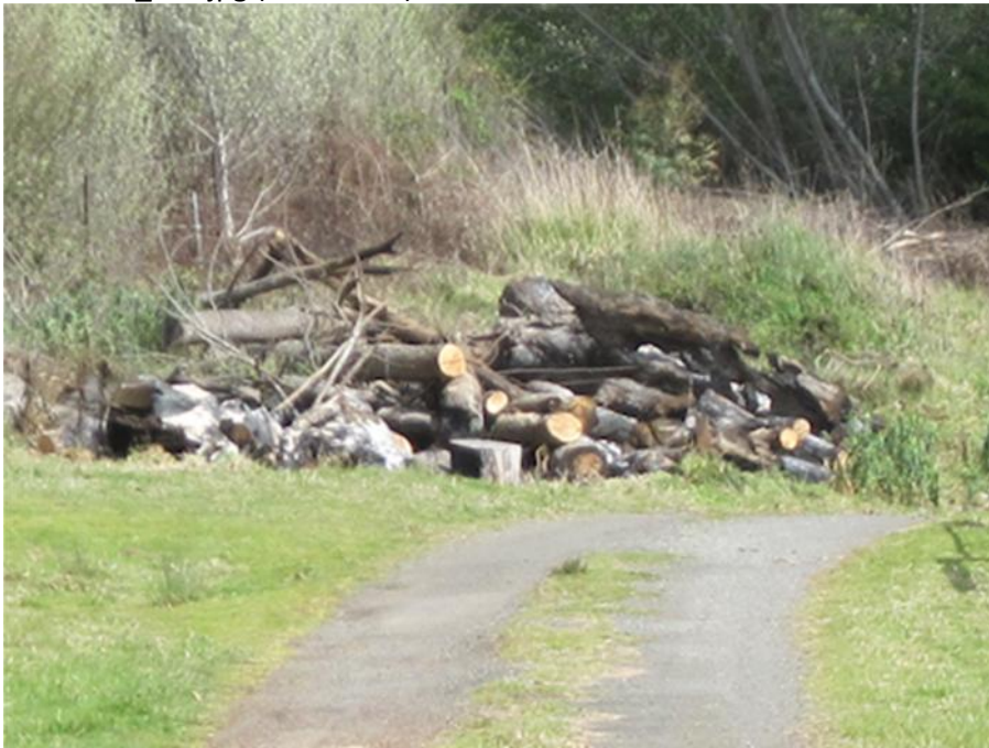
This is what was smoking and didn't burn. Picture taken when the smoke had stopped. 20110927_84a.jpg (238.34 KiB)