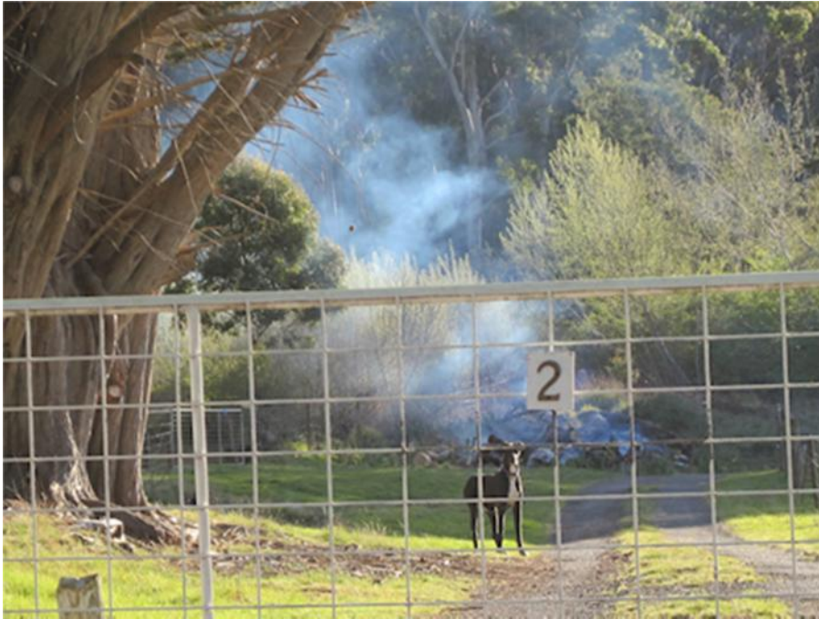
We were on the end of this thoughtless action. The smoke was even fading by now. 20110927_35a.jpg (263.93 KiB)