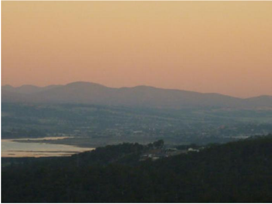
Toxic air all around Launceston P1000901small.jpg (26.17 KiB)