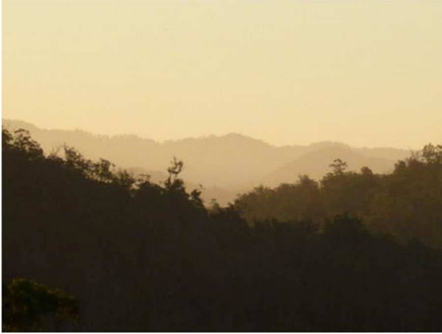
Smoke coming in from the West to Exeter P1000896small.jpg (24.54 KiB)