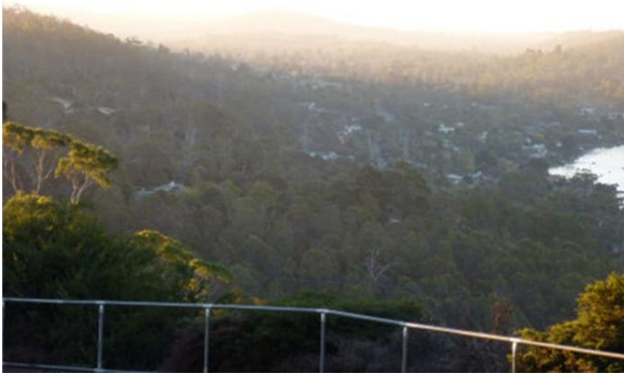
Looking north to Exeter and beyond there was smoke P1000889small.jpg (36.38 KiB)