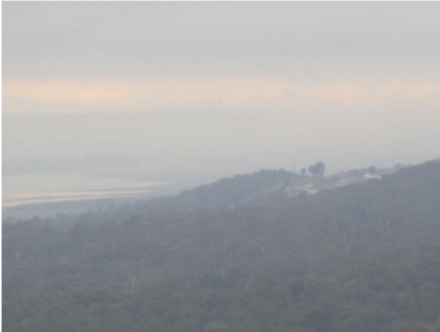
7.24am. Looking S/E from Grindelwald over the city of Launceston img_0374a.jpg (104.38 KiB)