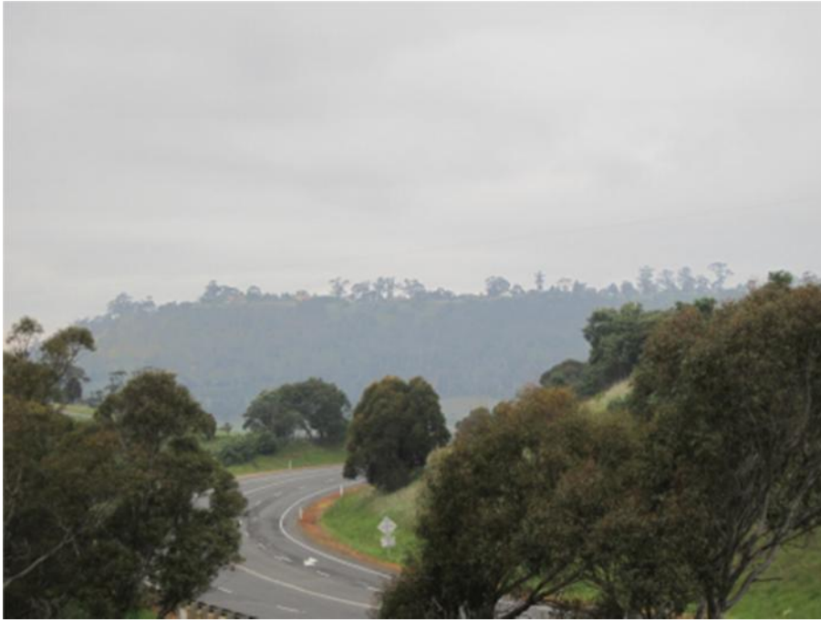
This shot shows Grindelwald smoked out. Taken from 3Km away at Brady's Lookout at 7.10 am img_0363a.jpg (146.68 KiB)