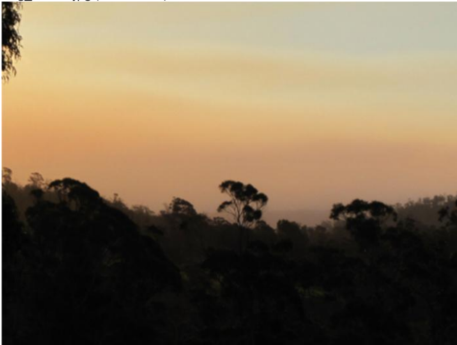
5.51pm. Much smoke looking west from Brady's Lookout img_0381a.jpg (114.91 KiB)