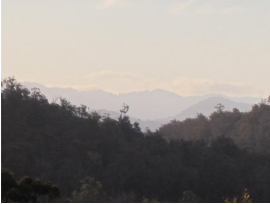
5.52pm. Looking north out of the smoke in Grindelwald into more smoke in our the Tamar Valley img_0384a.jpg (103.62 KiB)