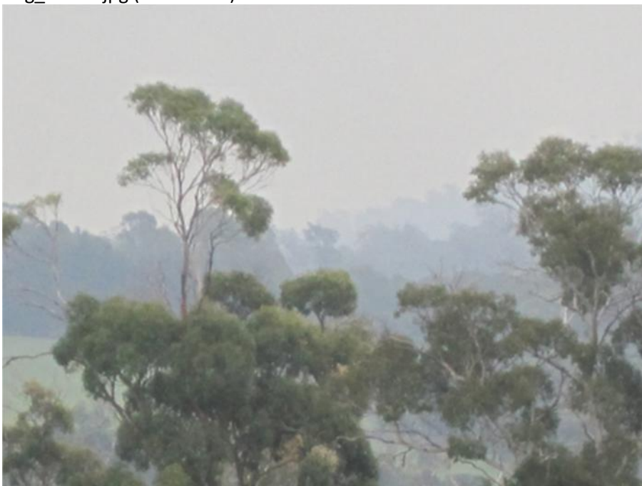
7.13 am Smoke to the West of Brady's Lookout img_0369a.jpg (150.77 KiB)