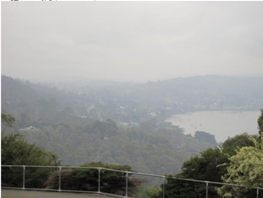
Thick smoke everywhere in the Tamar Valley. Taken from Brady's Lookout at 7am. img_0361a.jpg (144.12 KiB)