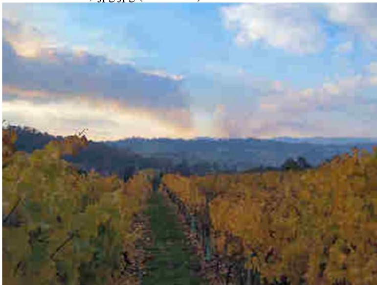
Smoke drifts towards us. Photo taken in vineyard behind our property. 100_1772.1a.jpg (12.38 KiB)