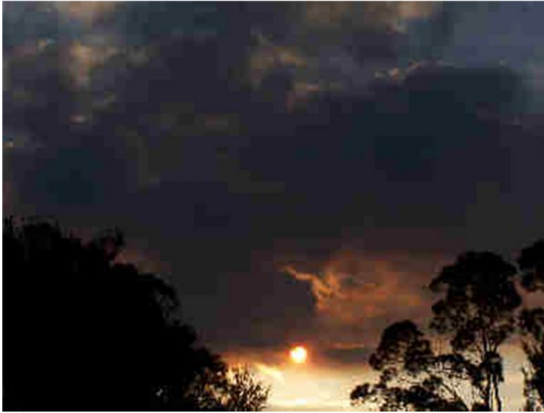
We are in the smoke. Photo taken at our side fence.